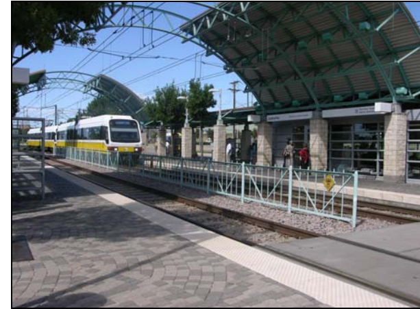
DART Light Rail Station

Dallas Water Utilities provides over 400 million gallons of water daily and maintains a water supply plan to accommodate the next 50 years of growth for the city.