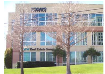
Preston Rd. Office Corridor