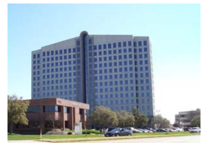
Preston Rd. Office Corridor

Source: Enterprise GIS, City of Dallas (base data from Dallas, Denton, and Collin County Appraisal Districts)