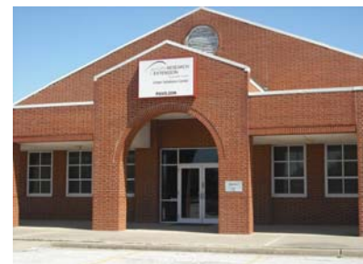
Texas A&M Extension Center