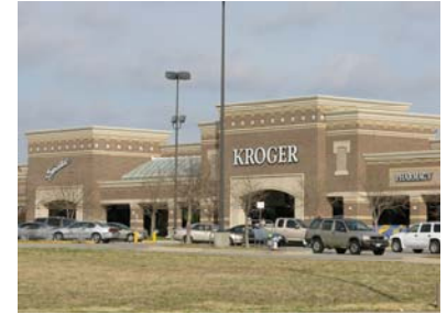
Frankford Dr. & Midway Rd.

ston Road. The office will employ approximately 200 employees to hire recruiters and employment specialists.