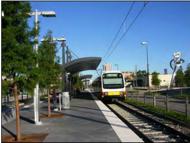
Figure 4. Deep Ellum Station

The Deep Ellum Station is the new gateway to this historic part of Dallas, known for its music and artsy vibe. The three part Traveling Man sculpture series will no doubt become a well-loved and much-photographed landmark for the area.