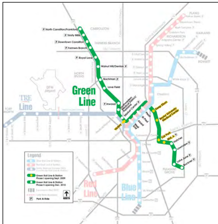
Figure 1. Map of DART Green Line Expansion

and the light rail is the first train service to the park since 1956. The last station is MLK, Jr., which is a neighborhood station serving area residents. Additionally, the Green Line adds regular service through downtown to Victory Station, which previously had been open only for special events at the American Airlines Center.