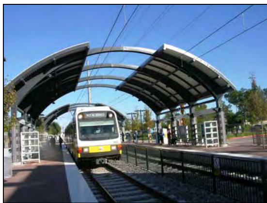
Figure 8. MLK, Jr. Station

The design of the Fair Park Station mimics the art deco architecture of the park itself. It brings visitors just steps away from the entrance to Fair Park.