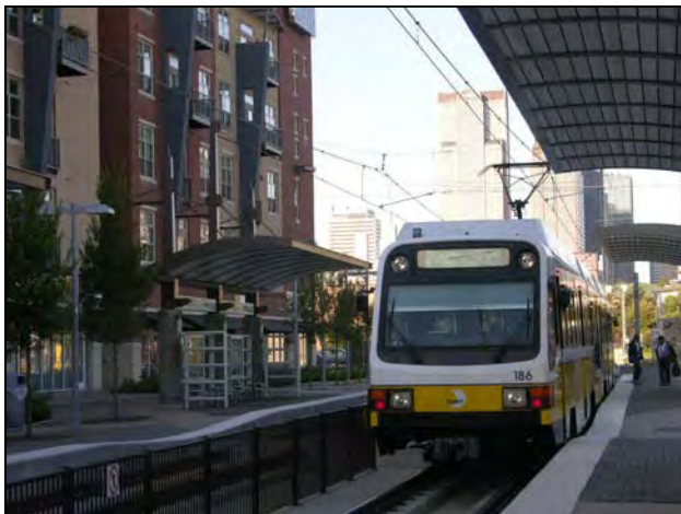
Figure 6. Baylor University Medical Center Station

The Baylor University Medical Center Station is directly across the street from the hospital and immediately adjacent to a new mixed-use development, the Ambrose. A two-acre plaza with gardens, mosaics and benches acts as a respite for visitors.