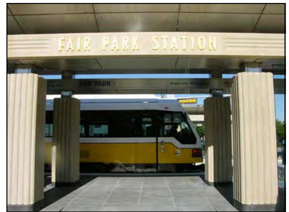
Figure 7. Fair Park Station

The Baylor University Medical Center Station is directly across the street from the hospital and immediately adjacent to a new mixed-use development, the Ambrose. A two-acre plaza with gardens, mosaics and benches acts as a respite for visitors.