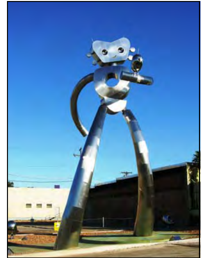
Figure 5. The Traveling Man-Walking Tall

The Deep Ellum Station is the new gateway to this historic part of Dallas, known for its music and artsy vibe. The three part Traveling Man sculpture series will no doubt become a well-loved and much-photographed landmark for the area.