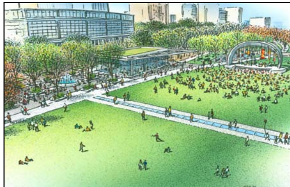
Figure 1. Rendering of Woodall Rodgers Deck Park

The stimulus funds have great potential to put Dallas residents back to work. Another benefit is an alleviation of some of the pressure on the city's budget during this time of economic trouble. The city is dedicated to complying with the transparency and accountability requirements of the funds and will make this information available to the public on the city's web site.