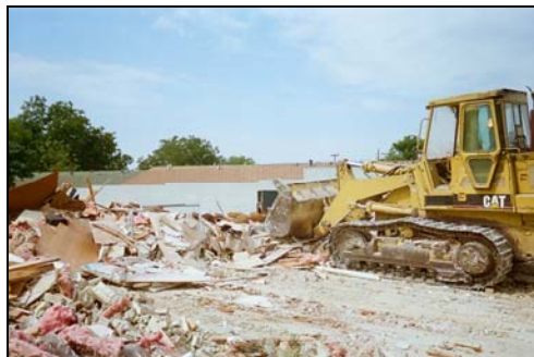
Figure 1. DEMOLITION WORK

On Thursday, October 2, developers demolished two motels in Council District 5 that have been closed due to violation of city ordinances (Figure 1). Area residents often complained that the Sunset and Southern Comfort motels on Lancaster Road were a source of criminal activity, including drug dealing and prostitution (Figures 2 and 3).