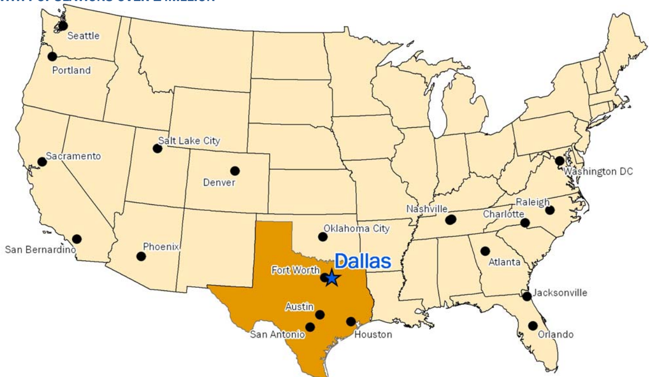
Figure 6 TOP 20 BEST-PERFORMING METROPOLITAN AREAS WITH POPULATIONS OVER 1 MILLION