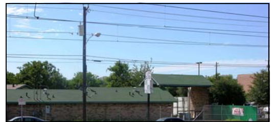
Figure 2. SUNSET MOTEL

Cliff, zip code 75216. The Urban League's vision is "to be the leading community based organization devoted to enabling all citizens to enter and enhance their position in the economic and social mainstream."