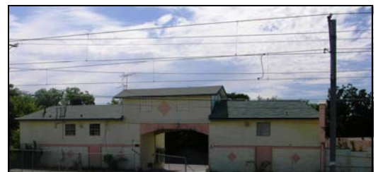
Figure 3. SOUTHERN COMFORT MOTEL

The demolition and construction of the new buildings should allow new businesses to grow in an area that previously would not have been conducive to viable commercial activity. The land is adjacent to the VA Medical Center and may be part of a future expansion in public transit.