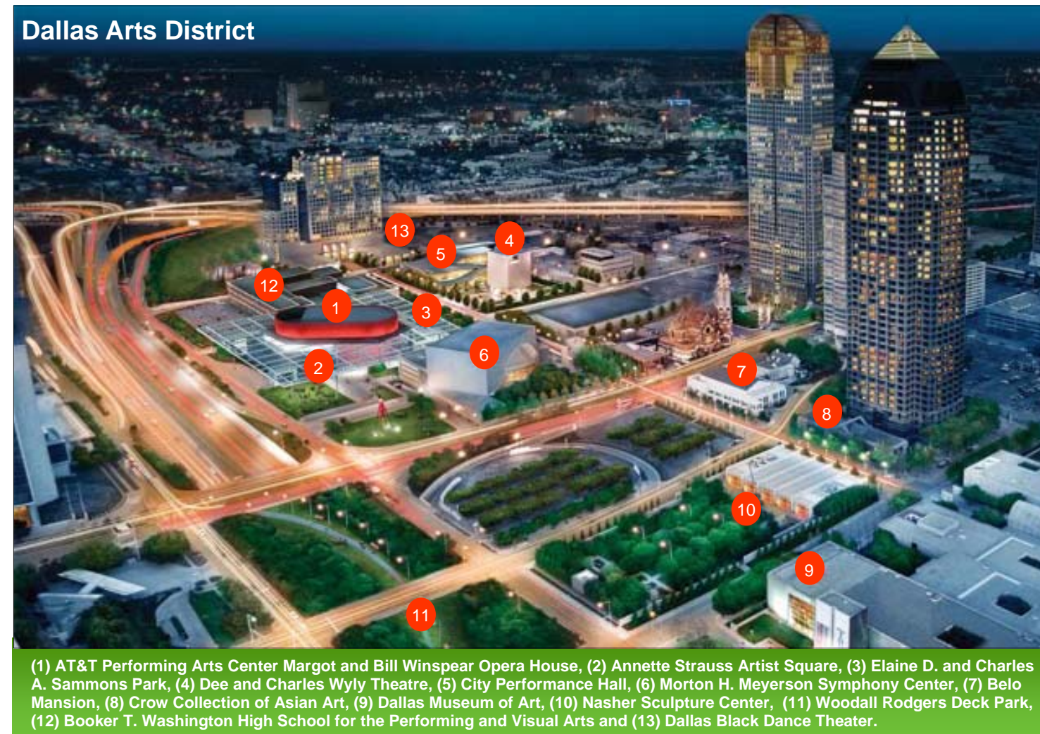
(1) AT&T Performing Arts Center Margot and Bill Winspear Opera House, (2) Annette Strauss Artist Square, (3) Elaine D. and Charles A. Sammons Park, (4) Dee and Charles Wylie Theatre, (5) City Performance Hall, (6) Morton H. Meyerson Symphony Center, (7) Belo Mansion, (8) Crow Collection of Asian Art, (9) Dallas Museum of Art, (10) Nasher Sculpture Center, (11) Woodall Rodgers Deck Park, (12) Booker T. Washington High School for the Performing and Visual Arts and (13) Dallas Black Dance Theater.

Forbes ranked Dallas in its top 20 most wired cities list for 2008. Dallas has the sixth highest rate of broadband penetration in the nation.